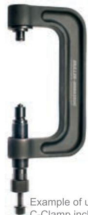
Example of use: C-Clamp incl. 12 to. Hydraulic spindle

A supplementary tool for # 609 390, # 609 399 and # 609 400, Universal Press Pull Sleeve Kit.