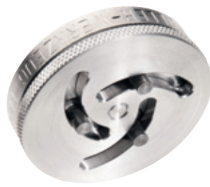
# 468 020/48 3-pin Adjustable Discs