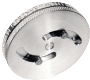
# 468 020/47 2-pin Adjustable Discs