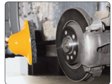
Max. speed 1500 rpm