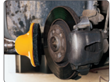
Grinding \varnothing 160mm